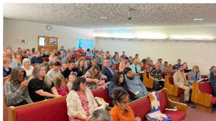
The Natalia church of Christ hosted a gospel meeting, and had previously worked hard by knocking doors all around the community.