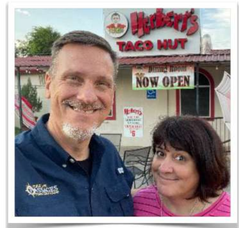
We pretty much planned our wedding during Friday night cheese enchilada dinners at Herberts!