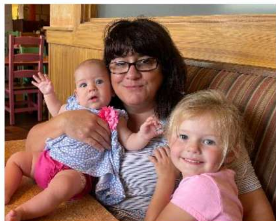
How I love these precious little girls!