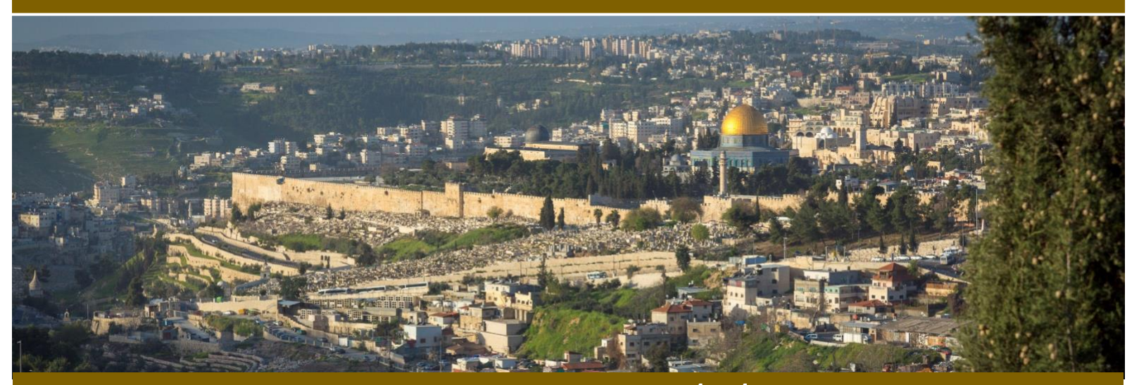
From Dan to Beersheba Exploring Israel and the Land of the Bible