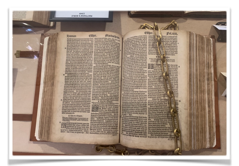
A copy of the Great Bible on display at Freed Hardeman University