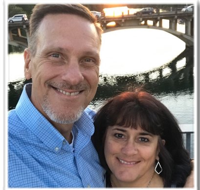
Celebrating 33 years on June 14!