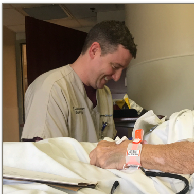
Drawing blood with a smile!