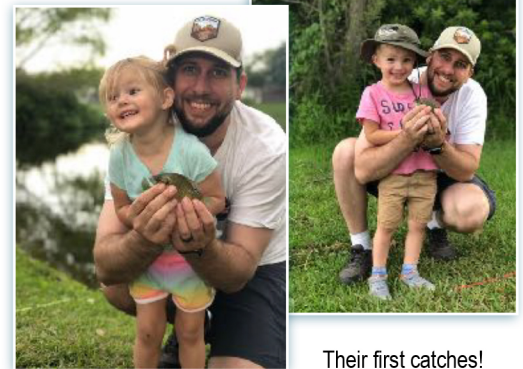
Their first catches!