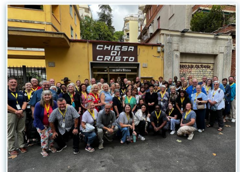
Our group of 56 gathering to worship with the church in Rome in October