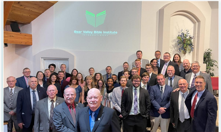
Bear Valley 2023 Class, Instructors, Faculty

When Jesus of Nazareth was born, the so-called Roman author of peace, Caesar Augustus (Octavian) was ruling as emperor over the Roman empire. In the year 42 B.C., his adopted father Julius Caesar was officially declared by the Senate as a god, thus making Octavian “the son of a god” and the author of “Roman Peace.” At the same time, angels announced to lowly shepherds in a field near Bethlehem the arrival of God’s Son, who became a ruler and Lord far different from the Caesars of Rome. Jesus, the King of Kings, could truly bring peace to a tumultuous world. The rulership of Jesus was non-violent, loving, and inclusive of all races and sociological standing. He loved all men and died that sinners