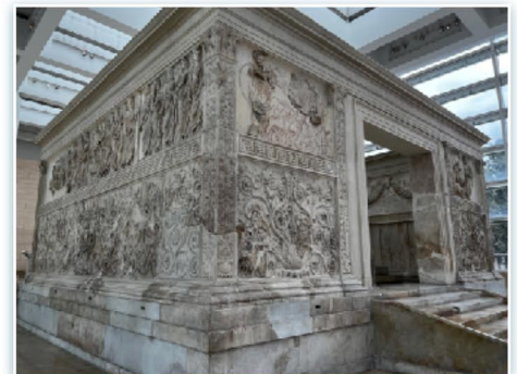
The Augustan Altar of Peace (Ara Pacis)