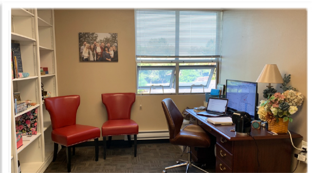
I'm enjoying having an office!