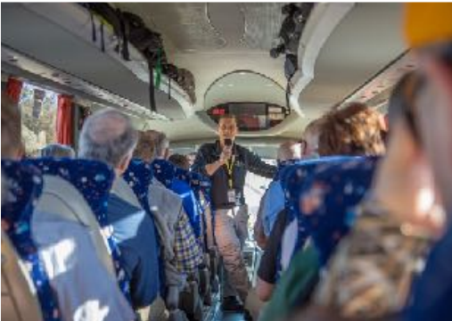
A lot of explanation and instruction takes place on our very comfortable buses during excursions.

context. The information and experiences gained from this trip will put you in a better position to understand the biblical text, share the word, defend the faith, and evangelize the lost. You will grow at an exponential rate, both in your understanding of the Bible, and in your own personal walk of faith. You will never look at the Bible in the same way again.