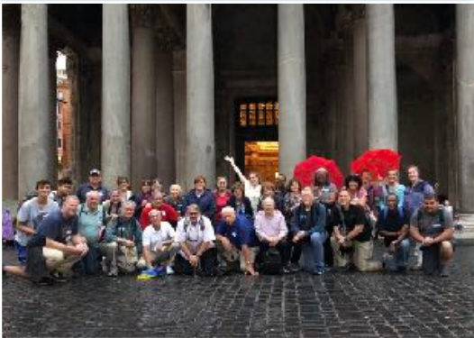
BLP Mediterranean Cruise group in front of the Pantheon in Rome in 2018

There is no way to adequately describe what traveling to biblical sites will do for you, both spiritually and educationally. On this incredible journey, you will walk the ancient streets of Rome, see historic sites in Greece, explore ancient ruins in the land of Israel, and more. Our highly unique program is designed to bring color, clarity, and a deeper understanding of the many customs, words, and practices of the people and settings of the Bible story and its historical and geographical