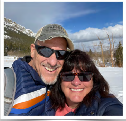
Our last Saturday in Colorado was spent in Rocky Mountain National Park

As always, we love and appreciate each of you for your friendship, love, and many ways that you support us. We pray God's blessings upon you!