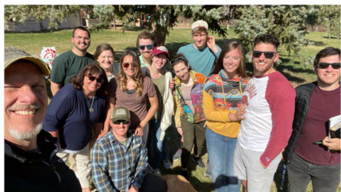
This group of fabulous young people spent a beautiful Colorado spring day with us, enriching our marriages!

Some of our ongoing projects include writing scripts for the new Bible Land Passages "Connections" series, editing and finalizing Volume III of the BLP documentary series,