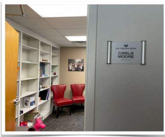
I'm "official" now with a nameplate on my office door!