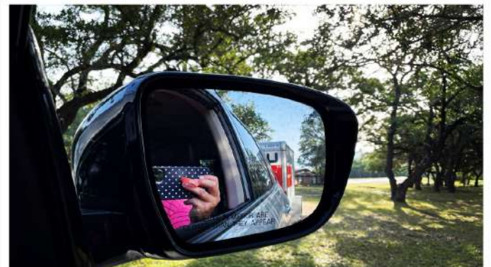
Texas home and U-Haul in our rearview mirror, headed back to Denver!