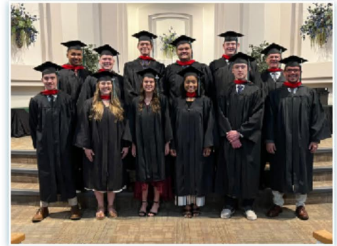
Bear Valley's 2023 graduation class!

“Two-thousand years ago, a pilgrimage to the grand temple built by King Herod the Great would have been mesmerizing. It was one of the great wonders of the world and was four times