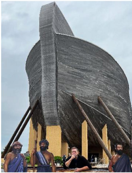
A fun visit to the Ark Encounter in Kentucky

bigger than the acropolis in Athens. Entering through its gates and walking among its porticoes was awe-inspiring, but at the temple’s epicenter a highly emotional and dramatic experience awaited the Jewish worshipper. But why? What was so significant about crossing through barrier and into court of the women? What occurred in the court of Israel, and what distinctive furnishings and sacred adornments were present within the holiest place on earth?”