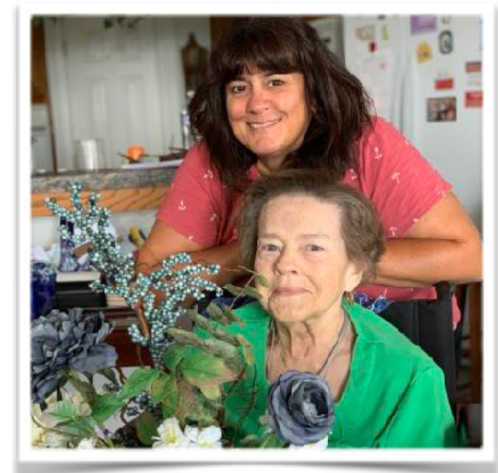
She made me this flower arrangement for my office in Denver. I will miss her.

"Mother-in-Law" they say, and yet. Somehow I simply can't forget: Twas you who watched his baby ways, Who taught him his first hymn of praise, Who smiled on him with living pride When he first toddled by your side. "Mother-in-Law" but oh, twas you Who taught him to be kind and true, When he was tired, almost asleep, Twas to your arms he used to creep, And when he bruised his tiny knee, Twas you who kissed it tenderly. "Mother-in-Law" they say and yet - Somehow I never shall forget How very much I owe To you, who taught him how to grow. You trained your son to look above, You made of him the man I love - And so I think of that today. Ah! Then with thankful heart I'll say 'Our Mother'. (Author Unknown)