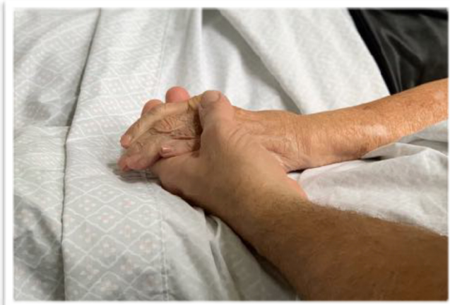
She was a blessing to all who knew her, and to so many who didn't.