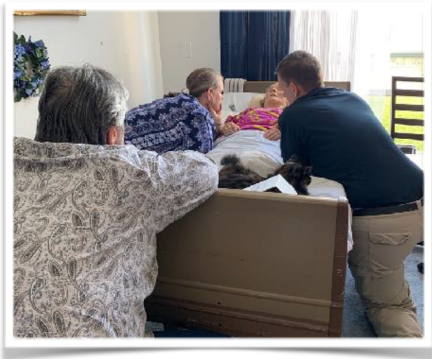
"Her children rise up and bless her..." Prov. 31:28