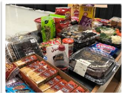
Restarted Weight Watchers in January. Ladies retreat snack tables are dangerous, but I resisted!