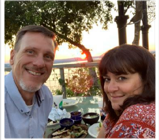
We celebrated our 34th anniversary on 6/14 with a sunset dinner overlooking Austin's Lake Travis