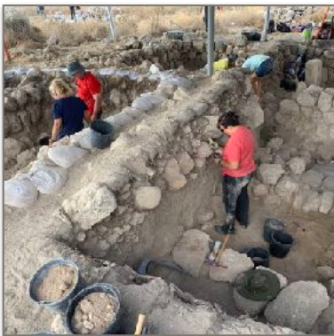
Digging up the past is dirty and fun work!