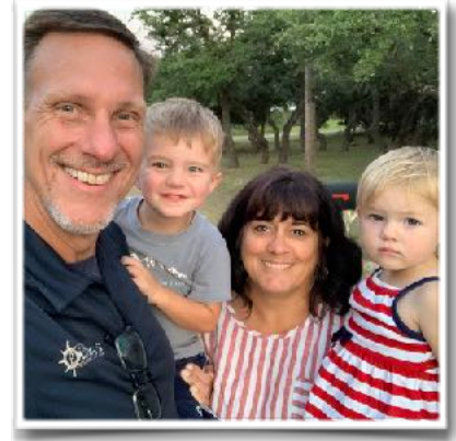
Blessed by these babies!