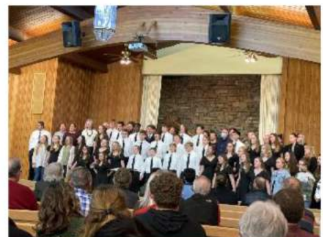
The "Singing Youth of Denver" (aka SYD) sang at the Englewood church building in January.