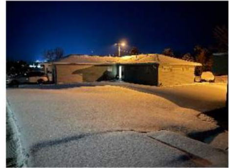
Several beautiful snows blanketed the Bear Valley campus and the little house in January!

If our quest as God's family is to produce the kind of Christian and the kind of spiritual kingdom that God wants, then we must plant the right kind of seed. From the parable of the farmer found in Luke 8, we learn that the seed of God's kingdom is His precious word (Luke 8:11), the Bible. To produce spiritual fruit that pleases God, the seed of God's word must be planted in the hearts and lives of His followers. God's word is essential to producing righteous fruit and the inheritance that is promised to the sanctified (2 Timothy 3:16-17; Acts 20:32). While the New Testament seed is over 2,000 years old, if it is carefully planted in the rich soil of godly lives today, it will produce what it did during the age of the apostles. Whatever fruit might have gone extinct can be reproduced when the original seed is planted today, or in any era. This is what we are seeking to do in our work at the Bear Valley Bible Institute and in our work overall with Bible Passages;