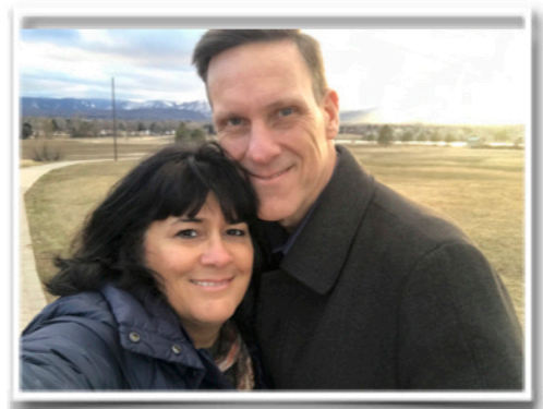
Our last night in Colorado for a few months!

We woke up early last Friday morning (March 29) to begin our journey from Dripping Springs to Hydro, Oklahoma for a ladies day and a gospel meeting - and when the alarm clock went off at 2:30 a.m. I had to lay there for a moment, peering around in the dark at my surroundings - did the ceiling look like the Denver ceiling, or the Dripping ceiling, or a hotel ceiling? It took a few minutes for the cobwebs to clear before I remembered we had arrived back to our Texas home a few days earlier but it was time to leave again for a few days! January, February, and March flew by. Our moves back and forth have seemed to divide our life into segments and that makes time seem even more fleeting. But we continue to enjoy being able to spend our time between both homes.