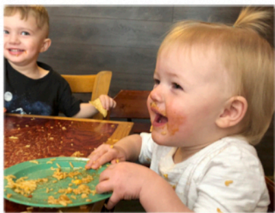
This little girl enjoys her mexican food - and this little boy is as sweet as he can be!