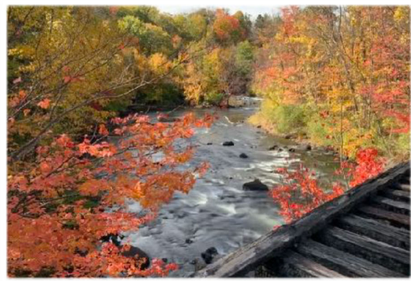
New England fall foliage is simply breathtaking - we are thankful for God's amazing handiwork!