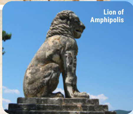
Lion of Amphipolis