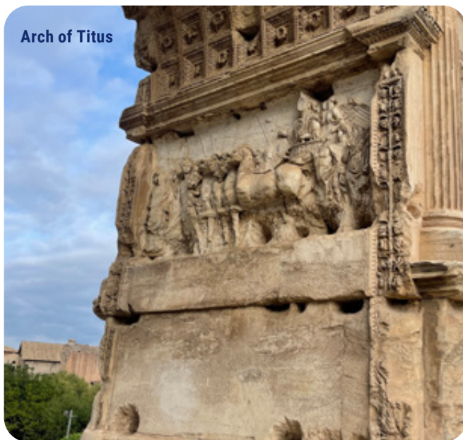
Arch of Titus

SIGHTSEEING: Unless otherwise stated, program as shown in the Day-by-Day Itinerary includes entrance fees to sites. Fees to sites visited on Free Day are NOT included.