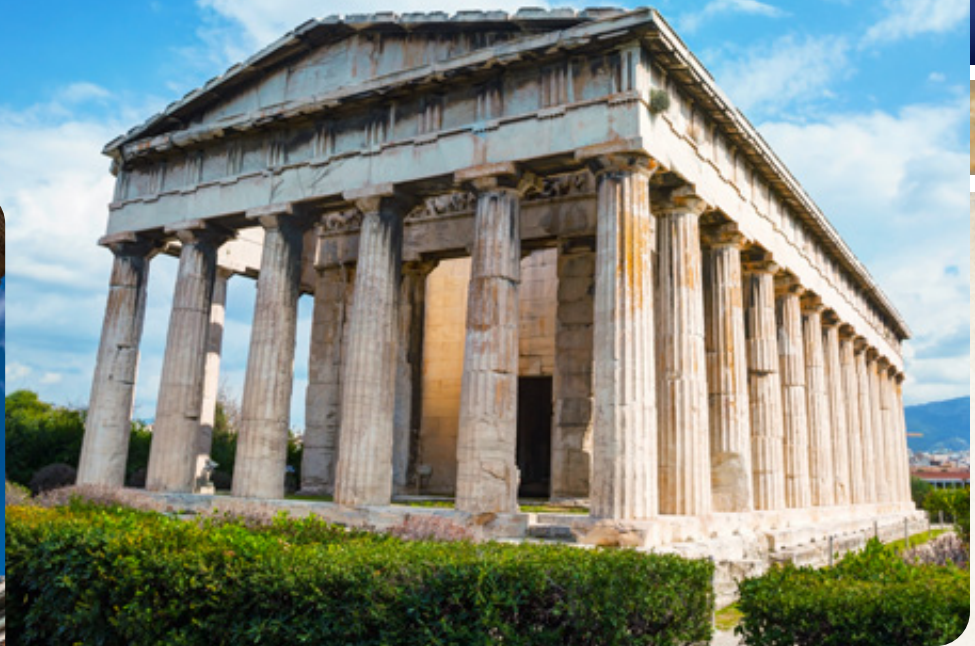
Temple of Hephaestus, Agora